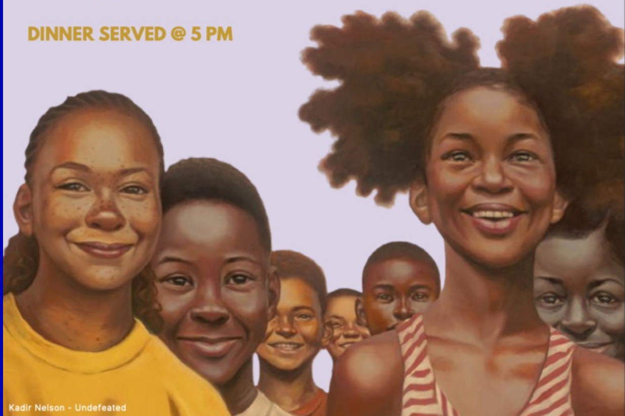
Kadir Nelson - Undefeated